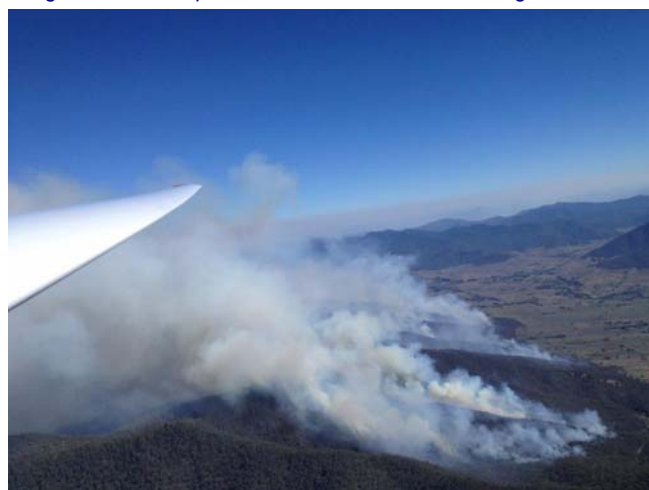
Open Libelle GUK flew 318km on Wednesday with some good ridge lift and assistance from the burning off.