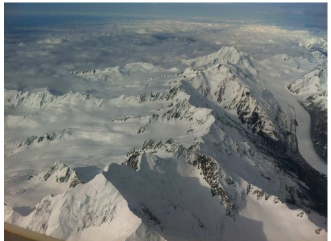
Mt Cook from Twin Astir ZK-GJW, 15000'.