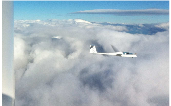
Duo Discus ZK-GUO at 11,000' over the Dunstan Range from Twin Astir ZK-GJW.

The last fortnight's recorded winch driver tally: DRf(12), ML(10), AE(6), OB(5), BoD(4), DRs(4), MBo(4), KF(1) and PD(1).