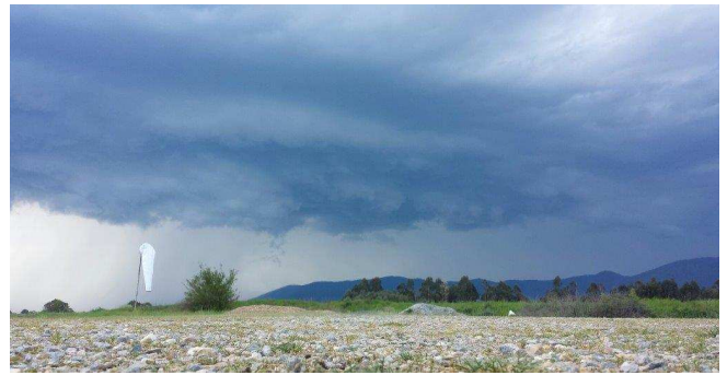
Inclement weather curtailed operations at YMBT on Sunday 11 th October.