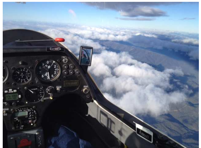
and from ASK21Mi GVS on 26 August.