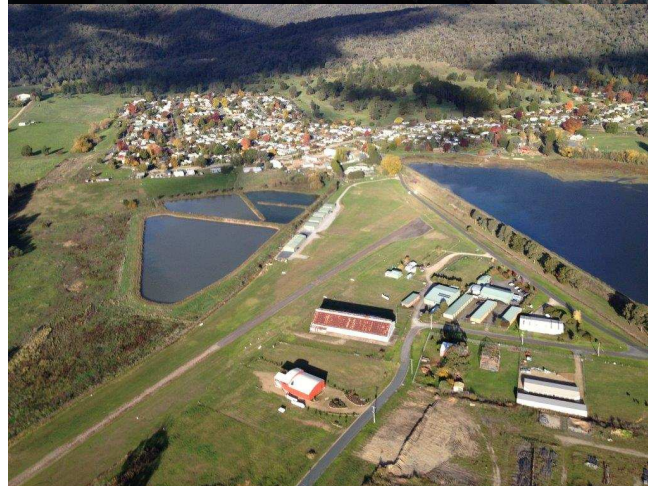
Views from H.301 Libelle, GUK on Tuesday.